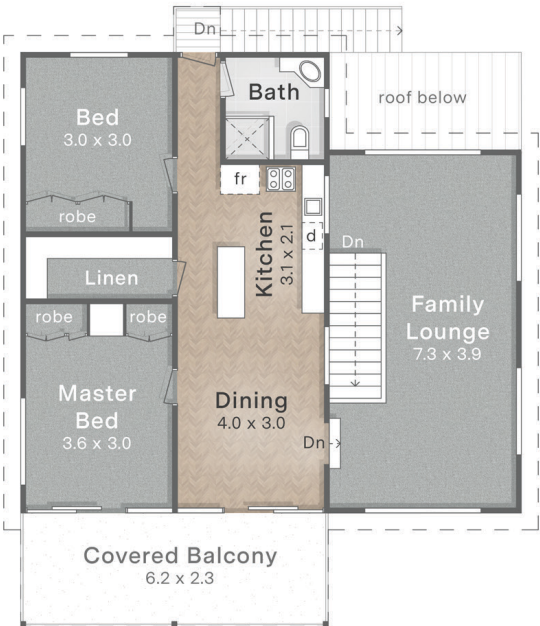
FIRST FLOOR Ceiling up to 2.8m

This market is held at PBC High School and is your typical farmers market - lots of produce and food stalls.