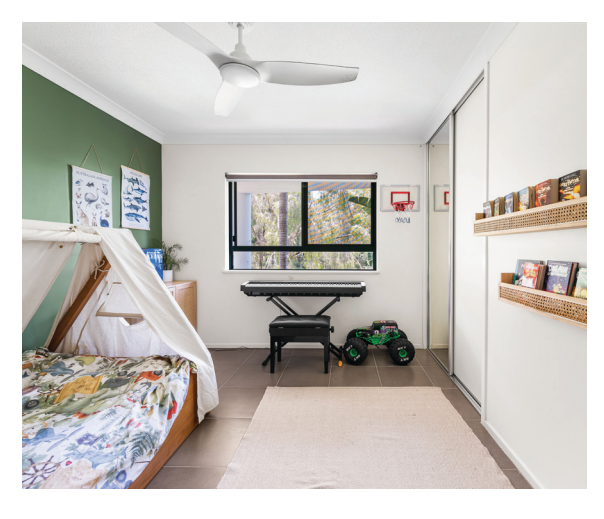
Total Unit Size: 159m2