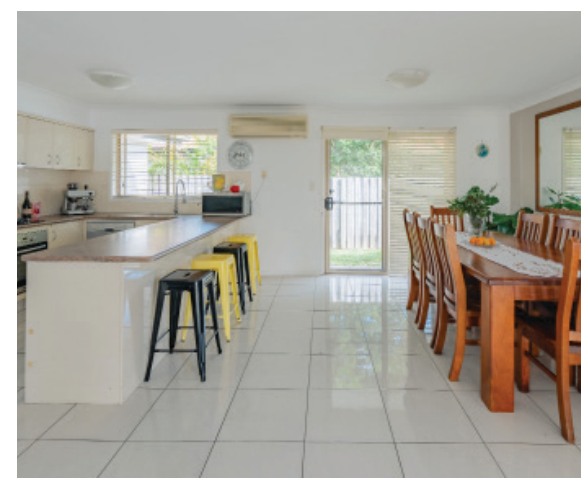
Total Land Size: 456m2 Internal Building Size:155m2