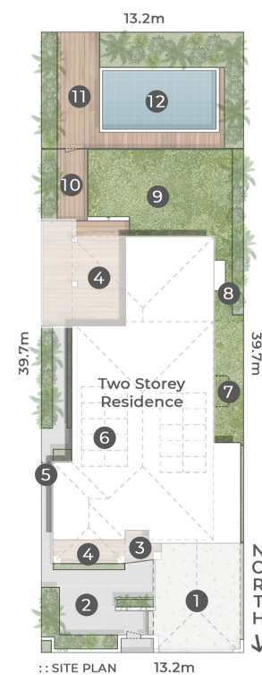
:: SITE PLAN 13.2m DURHAM STREET