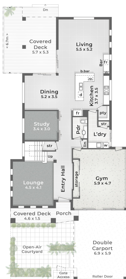
:: FLOOR PLAN Ground Floor 2.6m